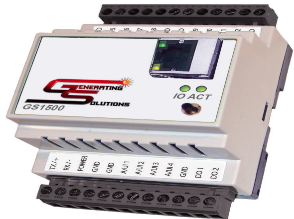
GS1500 (Hardwired/Ethernet Monitoring Device)