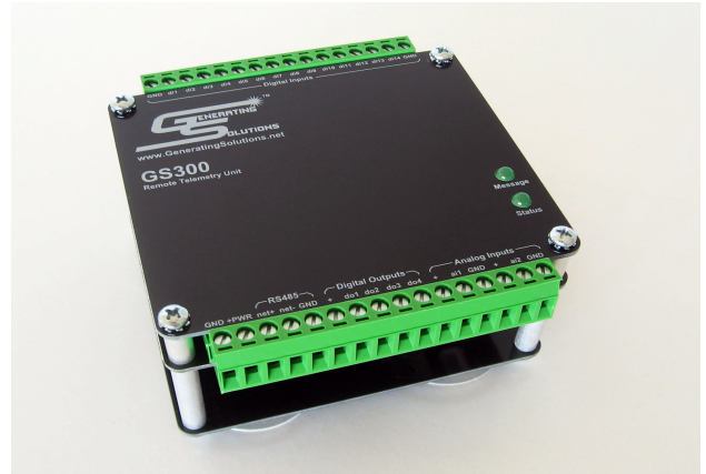
GS300 (Digital/Cellular Monitoring Device)